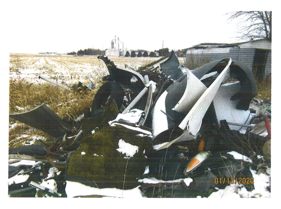
Date: 01/13/2020 Time: 1158 Direction: West Photo by: B. Schumacher Exposure #:2 Comments: This photo depicts a waste tire, miscellaneous car and boat parts, metal, household refuse, carpeting

Date: 01/13/2020 Time: 1156 Direction: West Photo by: B. Schumacher Exposure #: 1 Comments: Approximately five televisions and four mattresses